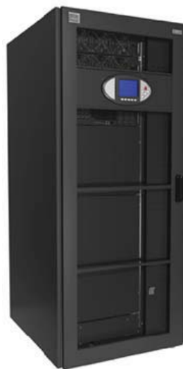
New Liebert Offering Liebert APM 3-Phase Modular / Scalable UPS System—15kW to 90kW