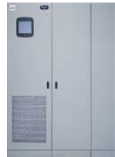
Power Switching Systems