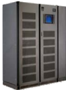
Large Facility UPS Systems