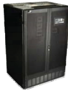
Power Distribution Systems