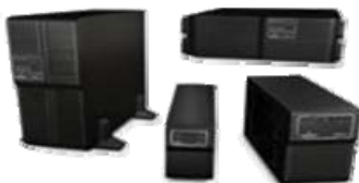
Desk Top UPS Systems