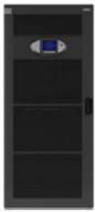
Network UPS Systems

Liebert is an industry leader in the Uninterruptible Power Supply and Power Conditioning industry. They offer a full range of UPS and Power Conditioning products and service solutions to address any customer need.